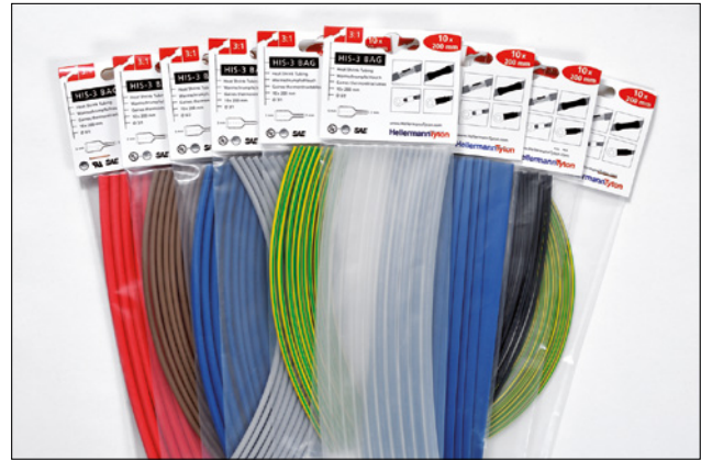
HIS-3 BAG available in seven colours and four sizes.